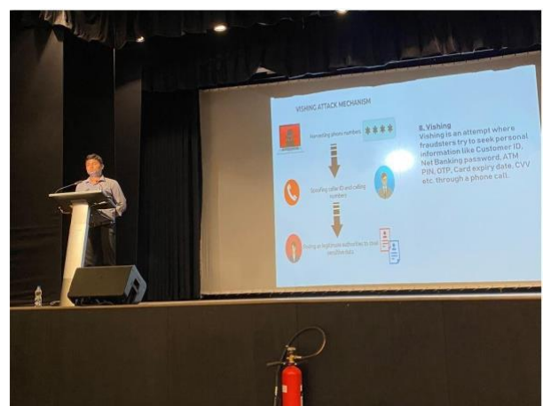
Introduction of Cyber Crime