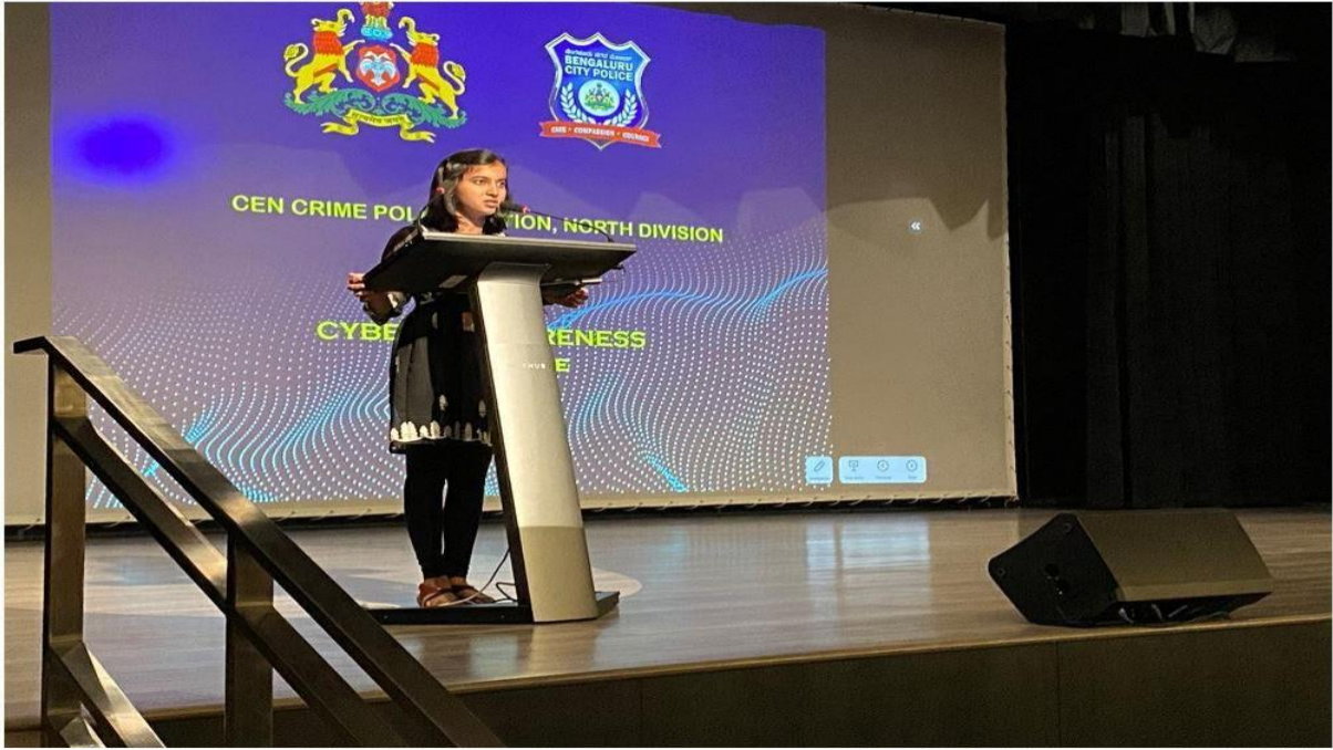
Start of the Workshop