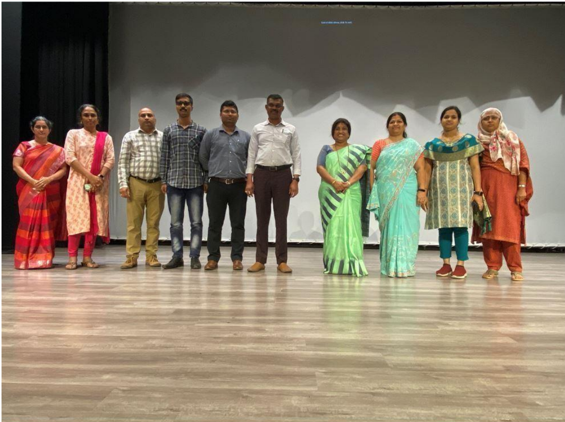
CEN Crime PS Team with AHSC members