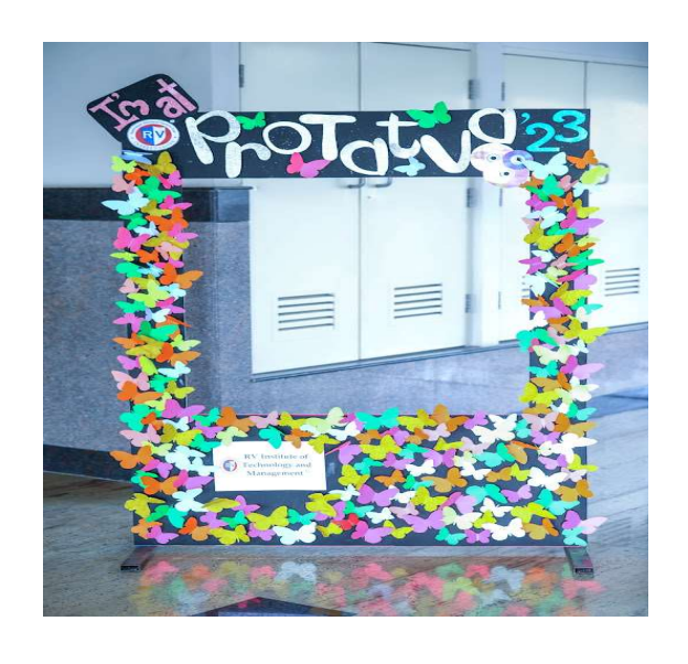
Selfie stand done by Students