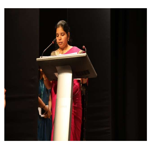
Vote of Thanks by Event- Coordinator