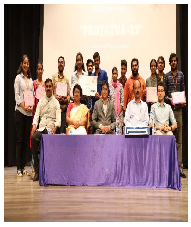
Protatva' 23 Team with Runners