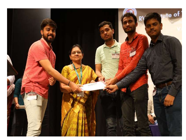
Distribution of Certificates to all Participants