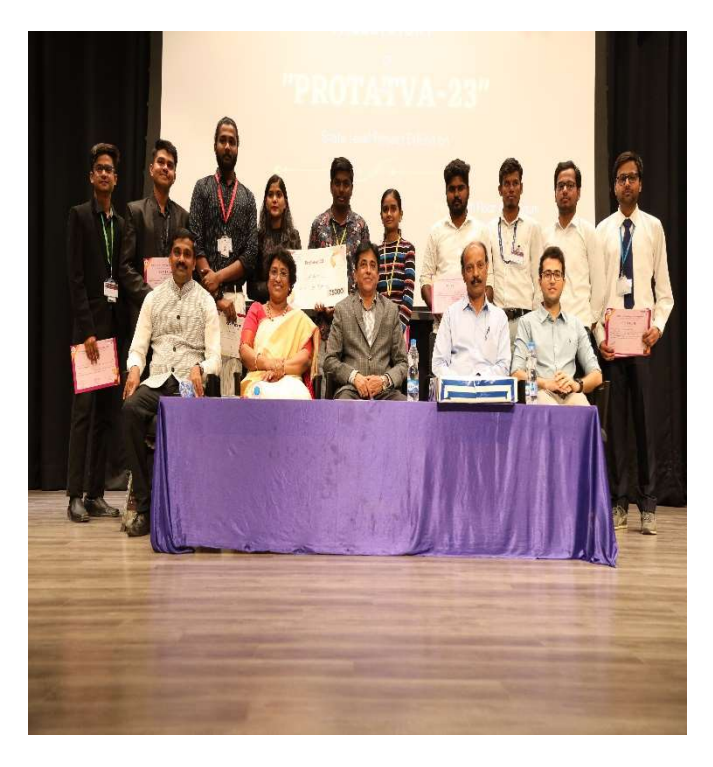
Protatva' 23 Team with Winners