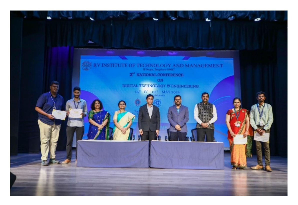
The best poster award for Dept. of ISE, NCDTE -2024