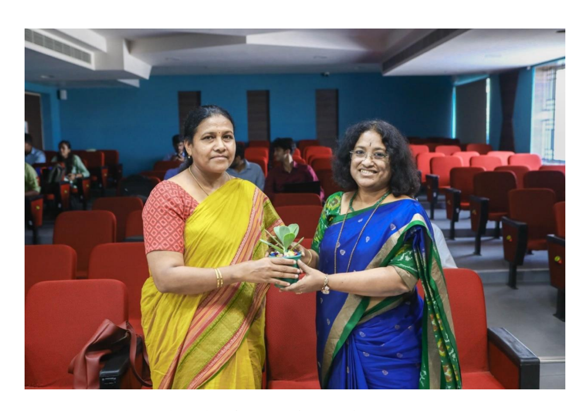
The panel members for Dept. of ISE session-1, NCDTE -2024