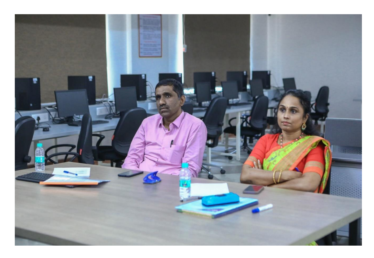
The panel members for Dept. of ECE session, NCDTE -2024