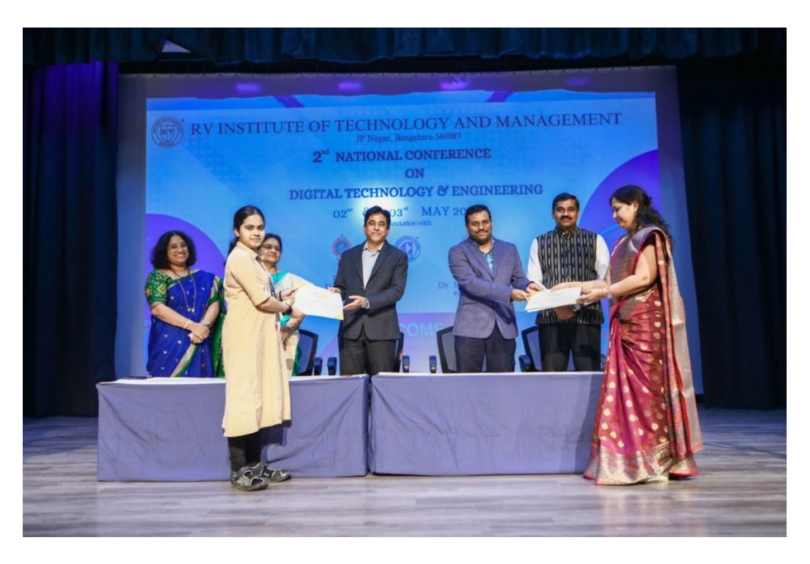
The best poster award for Dept. of ISE, NCDTE -2024