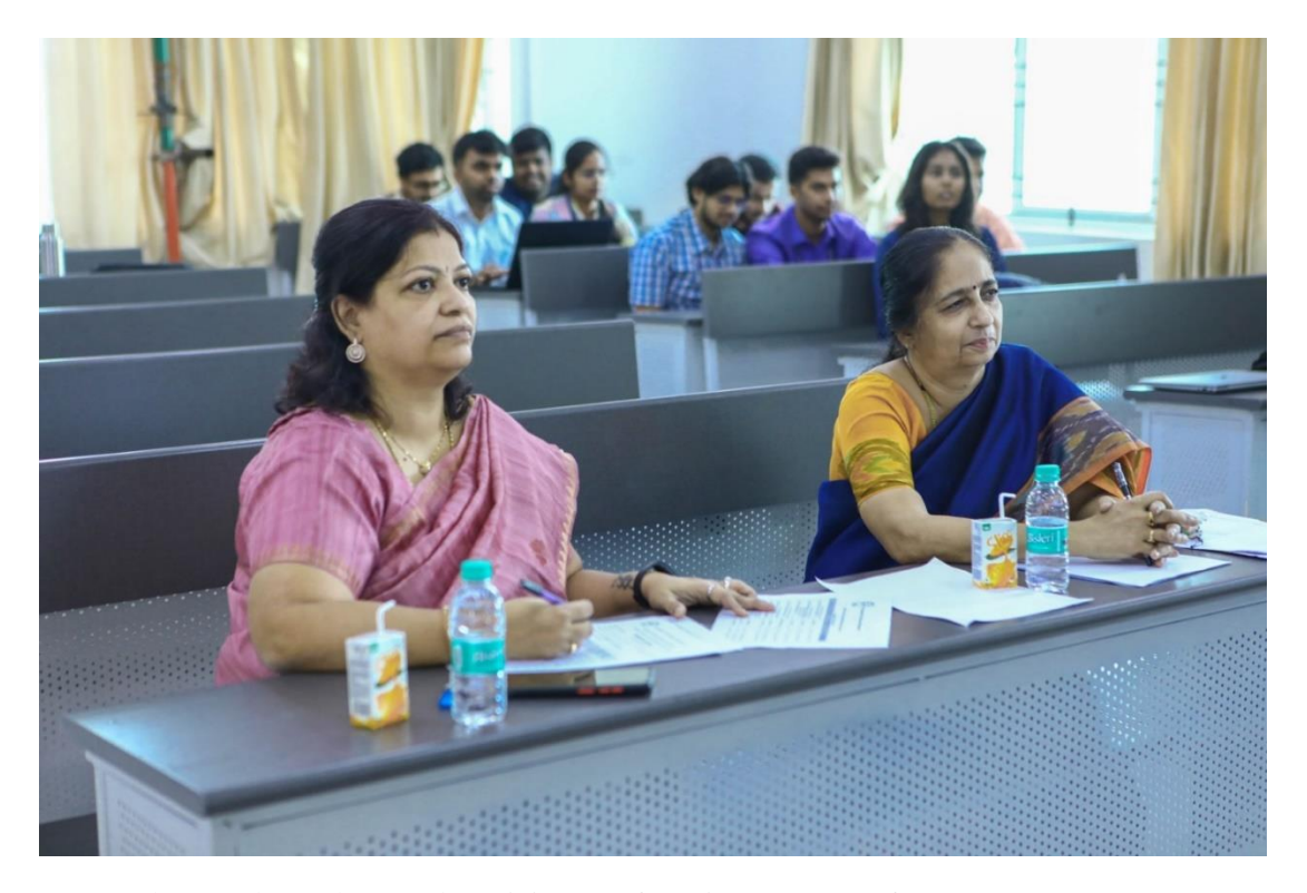
The Panel members and Participants of session-1, Dept. of CSE, NCDTE -2024