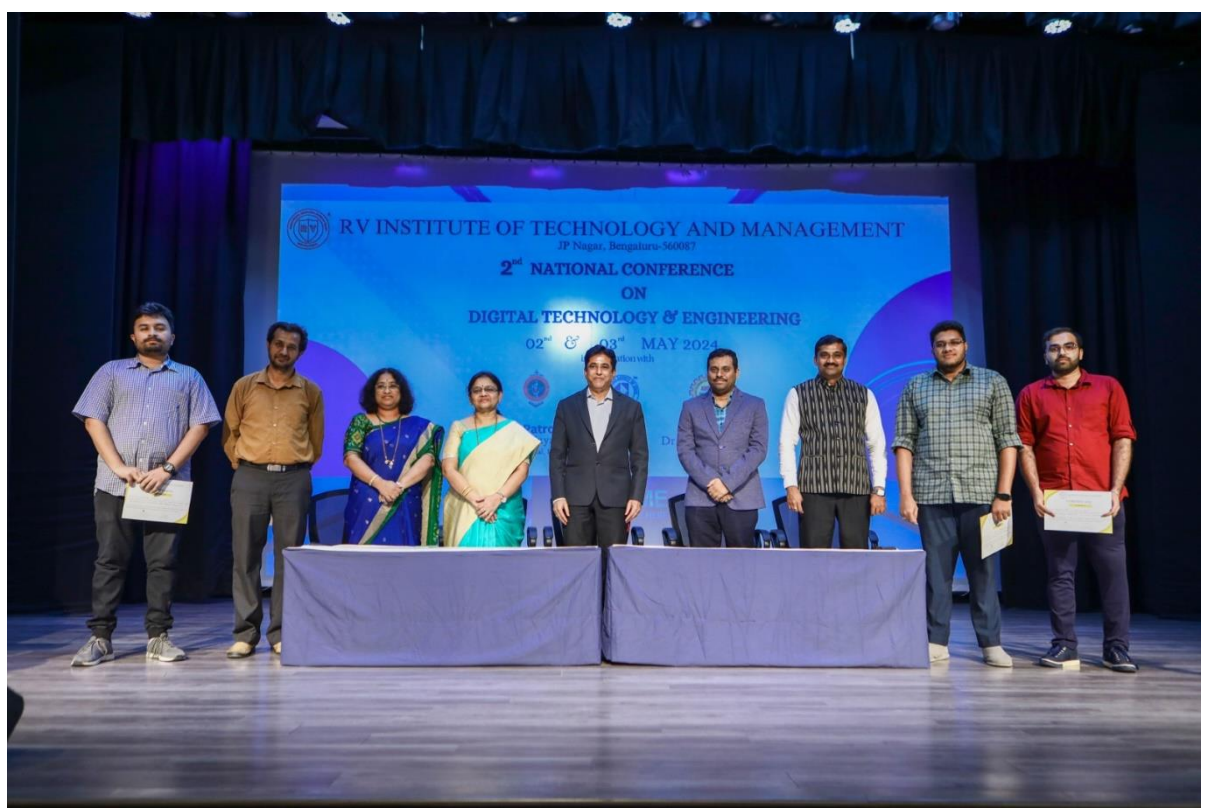
The best paper award for Dept. of CSE, NCDTE -2024