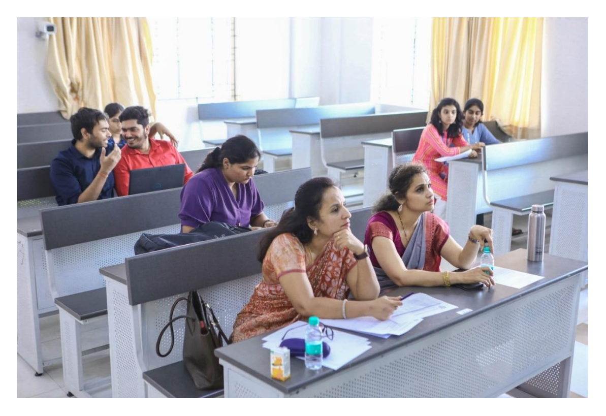
The Panel members and Participants of session-3, Dept. of CSE, NCDTE -2024