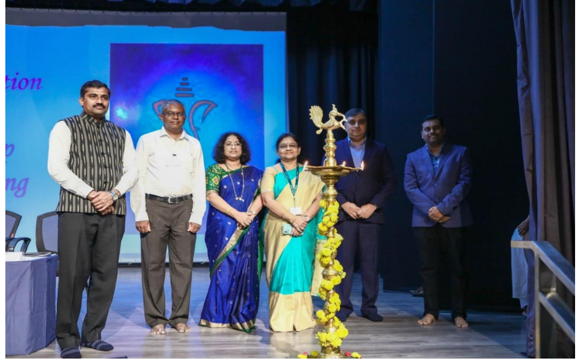
Inaugural Function of National Conference on Digital Technology & Engineering (NCDTE) – 2024 at auditorium, RVITM

During the valedictory session, NCDTE-24 bestowed one best paper award for each session, along with two best poster awards.