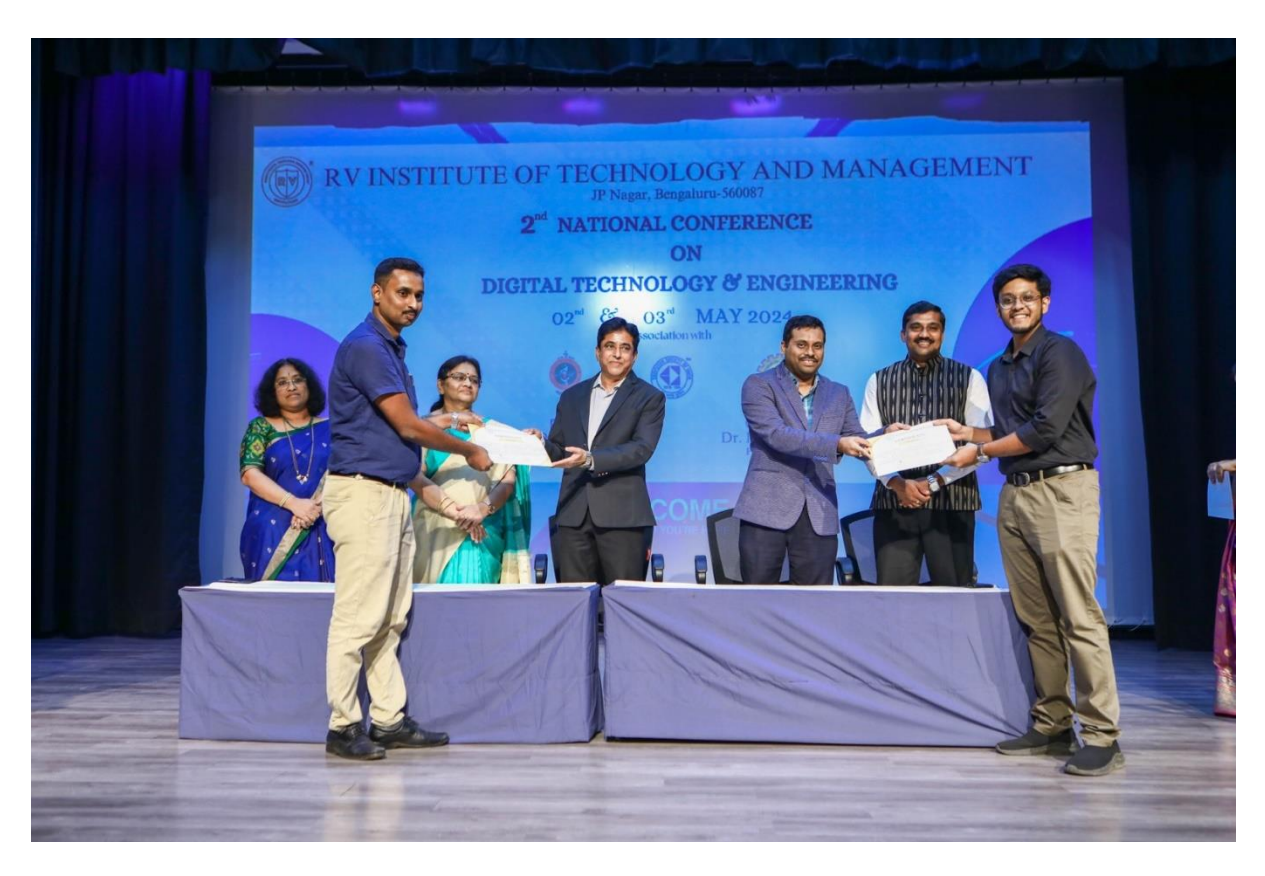
The best paper award for Dept. of ECE, NCDTE -2024