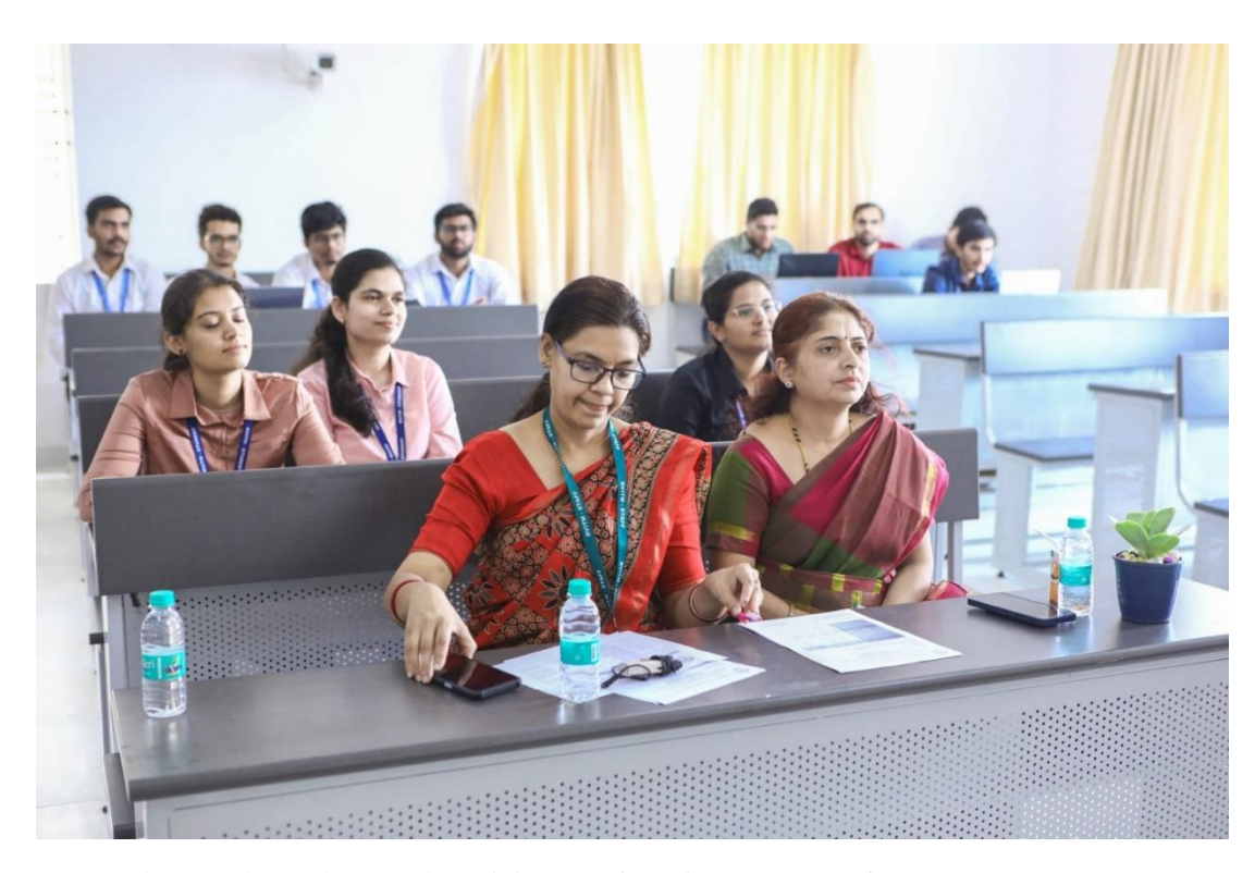
The Panel members and Participants of session-2, Dept. of CSE, NCDTE -2024