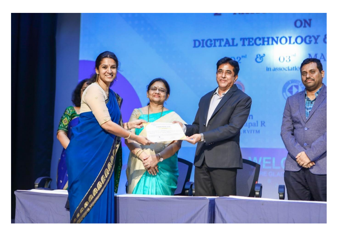
The best paper award for Dept. of CSE, NCDTE -2024