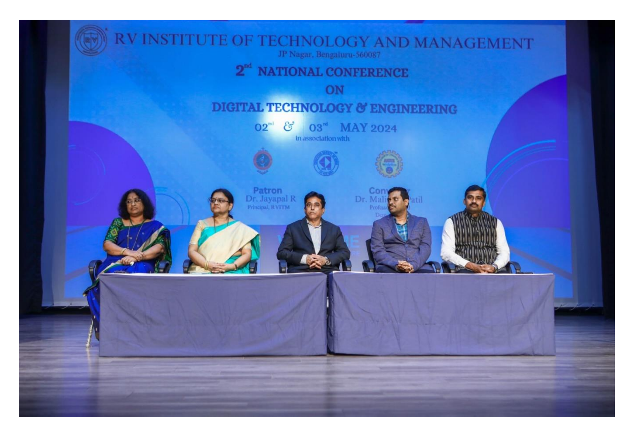
The valedictory function of National Conference on Digital Technology & Engineering (NCDTE) -2024 at auditorium, RVITM