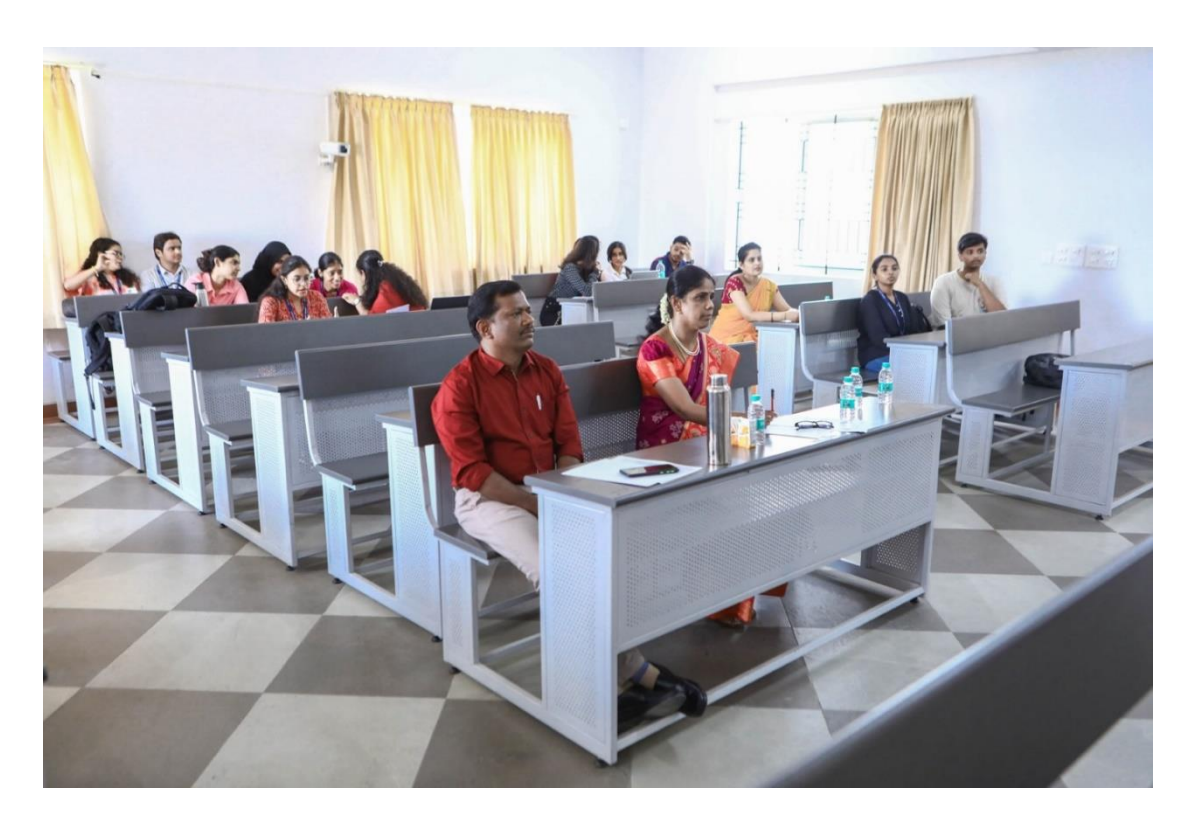
The Panel members and Participants of session-2, Dept. of ISE, NCDTE -2024