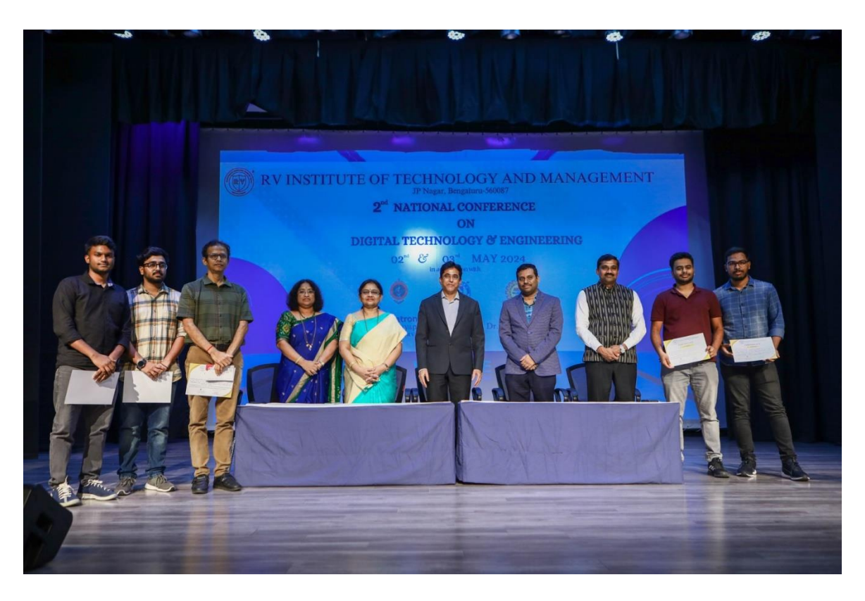
The best paper award for Dept. of CSE, NCDTE -2024