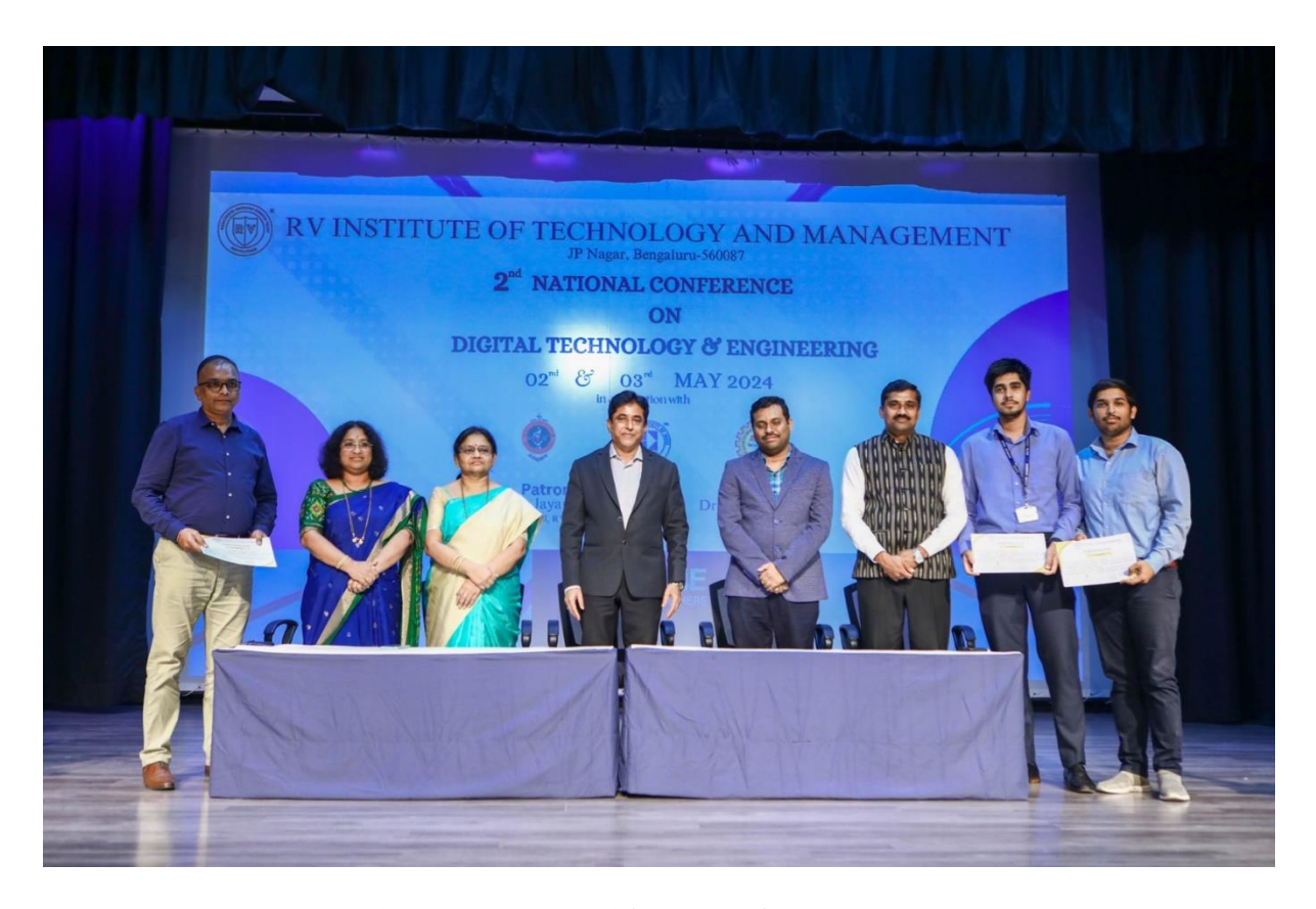
The best paper award for Dept. of ME, NCDTE -2024