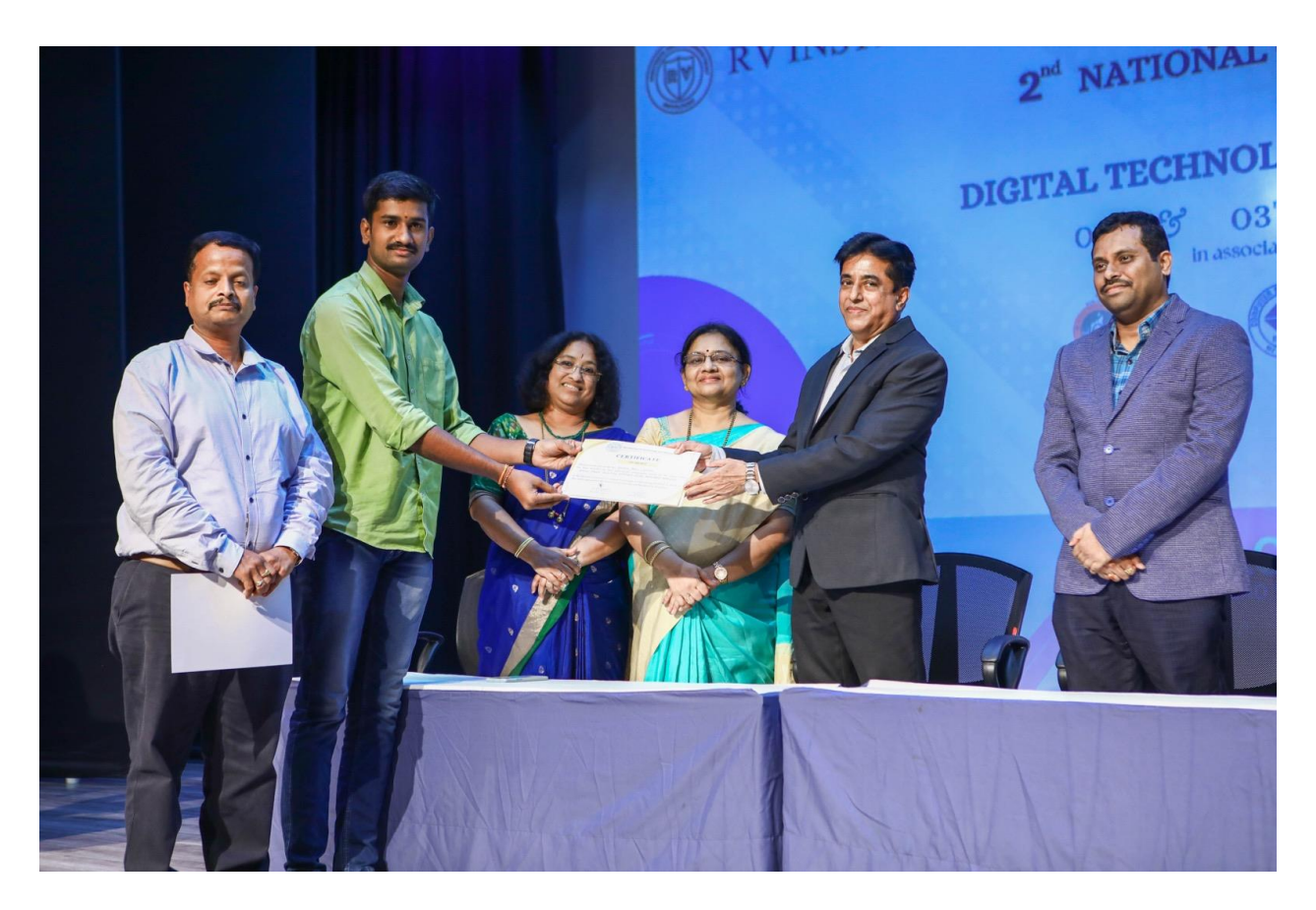
The best paper award for Dept. of ISE, NCDTE -2024