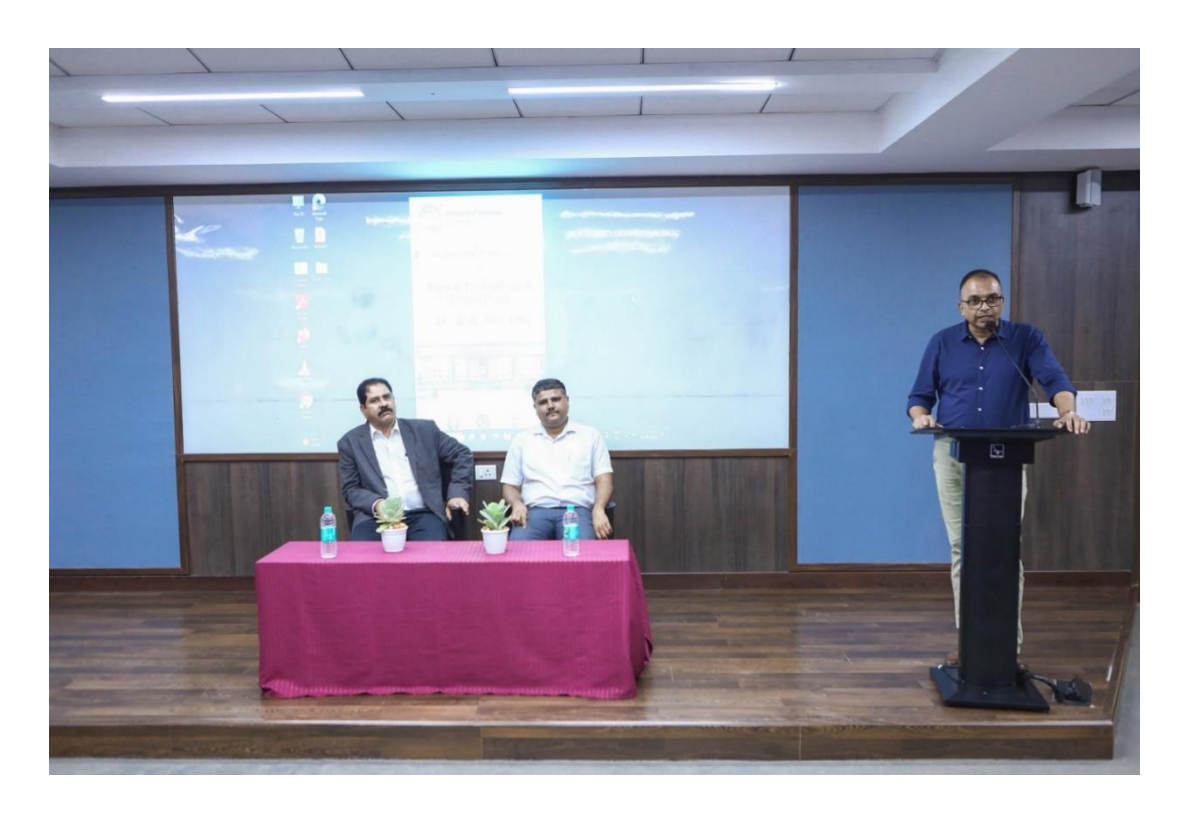
The panel members for Dept. of ME session, NCDTE -2024