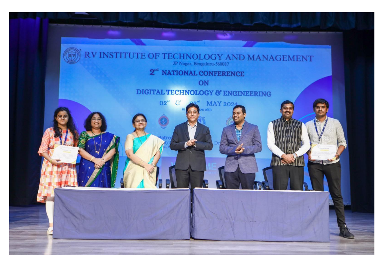
The best paper award for Dept. of ISE, NCDTE -2024